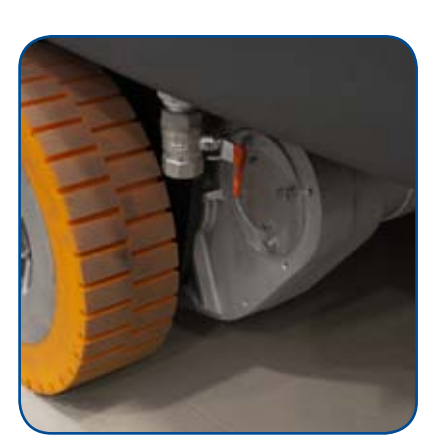
innovative 3wheel drive system ensures perfect traction in every operating condition. The high power of the three motorwheels allows the machine to get over remarkable slopes.

autonomy of the battery ensure a productivity at the top of the range. The wide rear opening allows for an easy and quick refilling of the cleaning solution tank. The motorwheels, designed and built by Fasa, grant optimal performances and exceptional reliability (over 30.000 hours). The